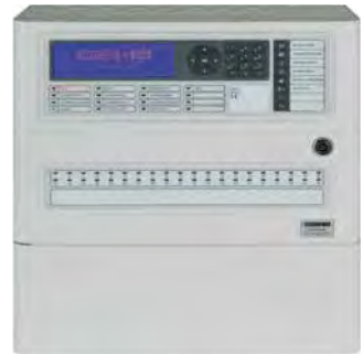
DXc 2/4 control panel supplied as standard c/w blank cover.