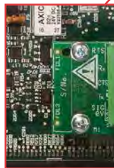
Internal view of panel