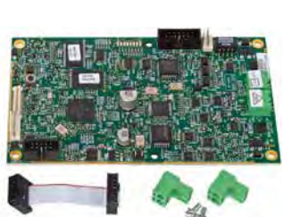
Network card kit