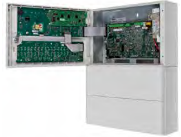
Front view of custom keyplate cover with metal plate removed

The custom key plate cover is supplied with a removable painted metal plate, can be drilled to accept key switches or indicators and labelled accordingly by the installer. This can be used to replace the blank cover supplied with the DXc2/4 control panels or used with the extension back box.