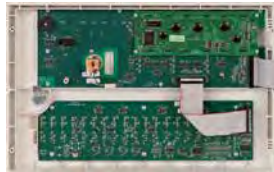
rear view of front door with zone LED kit fitted