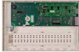
rear view of front door as supplied