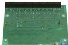
Part No. K461