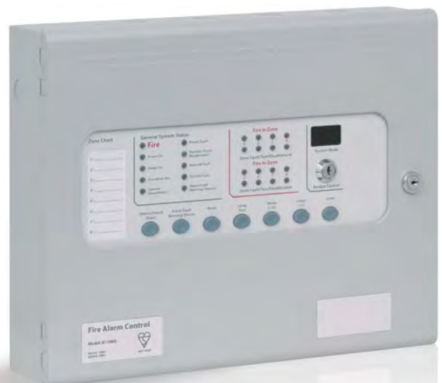
Model No. K11080M2