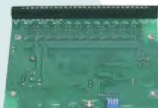
Part No. K580