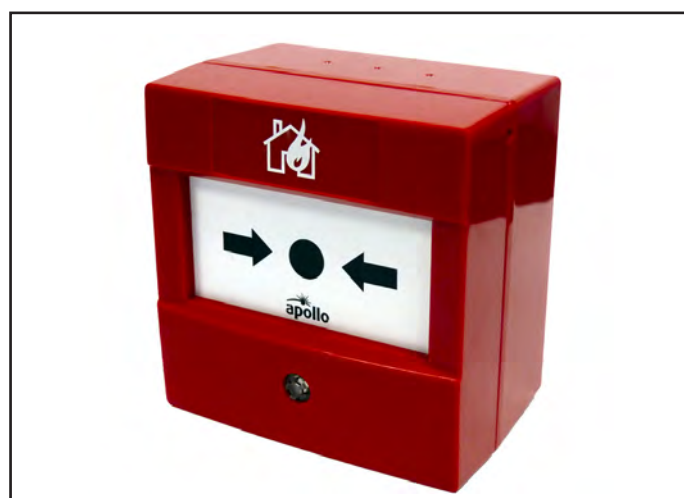
Part no 55200-001 - Conventional Manual Call Point (indoor only, outdoor not shown)